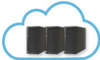
RISCO Cloud Server